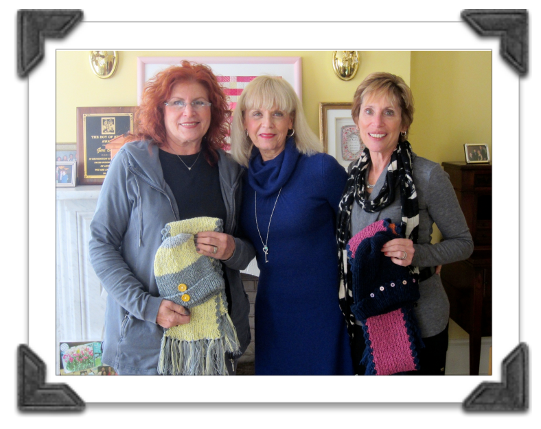
CARE TO KNIT presents hats and scarves to 1 in 9 Hewlett House.