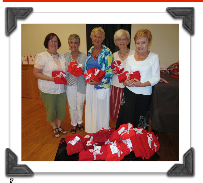
The Heartwarmers host an event to benefit WomenHeart.