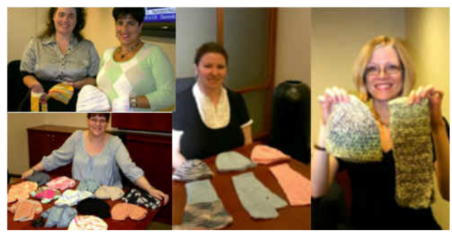
Members of the BlackRock Crafters Care Group

"We share hats with our tiniest patients, in the Neo-Natal Intensive Care Unit, to help them maintain their body temperature. They just can't do it on their own."