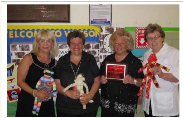
Volunteer School of the Year Award presented to Floyd B. Watson School, Rockville Centre, NY