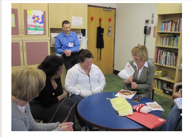
CTK teaches knitting and crocheting at Cohen Children's Medical Center